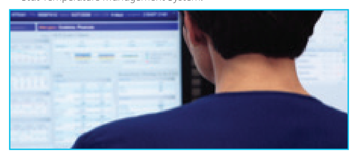
3. Open the BD Health Sight \mbox{\ensuremath{^{\text{\tiny M}}}} Patient Association Application.