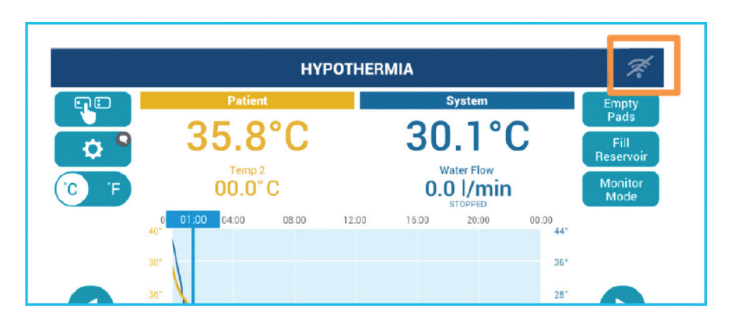
2. Confirm that the BD Arctic Sun™ Stat is connected to WiFi.